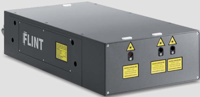
FLINT-FL2 with an integrated harmonic generator