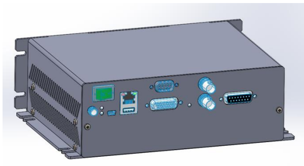
EBD-120210, 1 CH